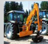
DK 4.5 with skidding grapple