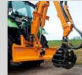
Mounting on tractor's rail with skidding blade

All prices given in EURO, exclusive of VAT. Pricing basis Zell a.H.