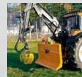
DK 4.5 with Quick-change mounting