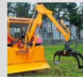
Quick-change variation with skidding blade