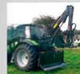
DK 4.5 with scoop