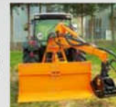
DK 1.9 combined with mounted winch